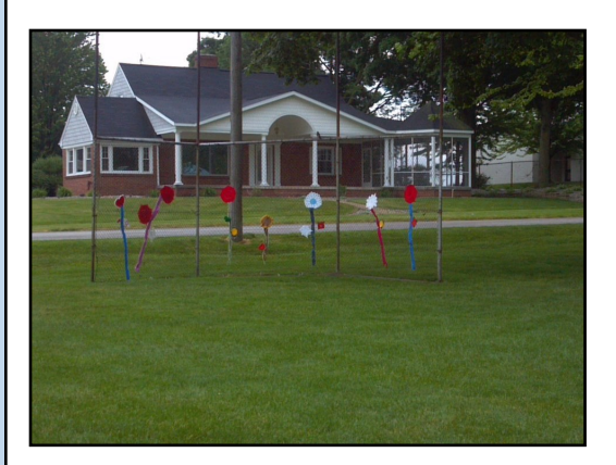
Remember the yarn bombing of 2012....

Remember, remember the 4th of November... wait, wrong month! But do you remember this scene all around Hopkins? The mysterious yarn flowers and decorations that sprung up one evening and disappeared just as quickly two weeks later? Well, we are at it again (and this looks like its going to become an annual tradition so get ready!) and we need you! In 2013 we are working to reinvigorate the library - new programs, new materials, and new ideas (p.s. we want your ideas!) and we want to spread our enthusiasm around!