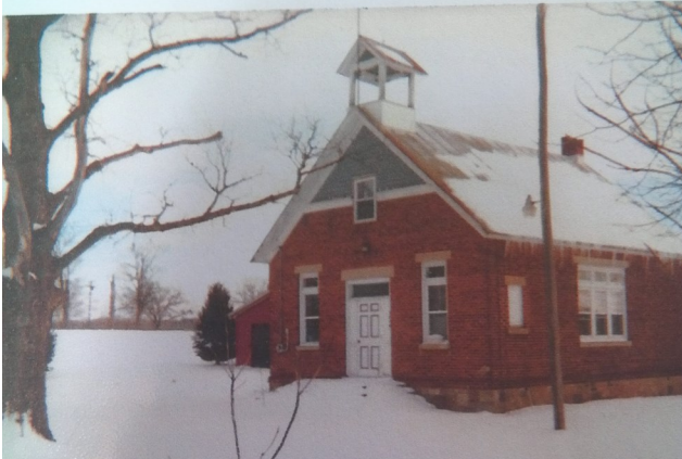
Photo raph from a book of one room school houses in Hopkins Township

The present Ohio Corners School looks much as it did years ago. It is presently used in 2009 as a home.