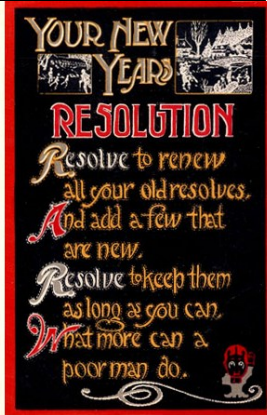
20th Century New Year's Resolution Card