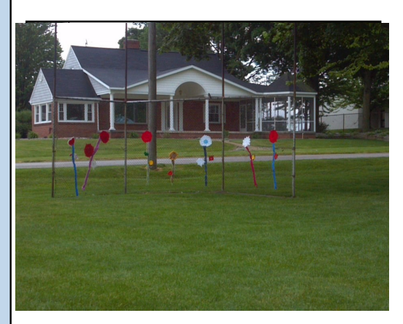
Yarn flowers from the great Yarn Bombing!

Are you ready for Spring? I know I am! No matter how light the winter, those first crocus are always an exciting sign of fun to come. This year we are planning to expand our programming and we are looking for your ideas! Let us know what you want to learn? Do you want to see a class on bone broths? What about the super natural? Are you interested in old books, learning languages or something else?